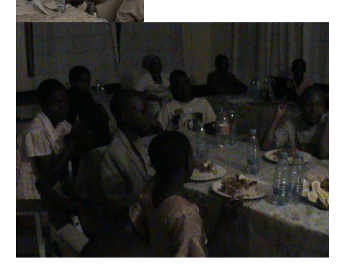
Day 4 — Leaving the Island